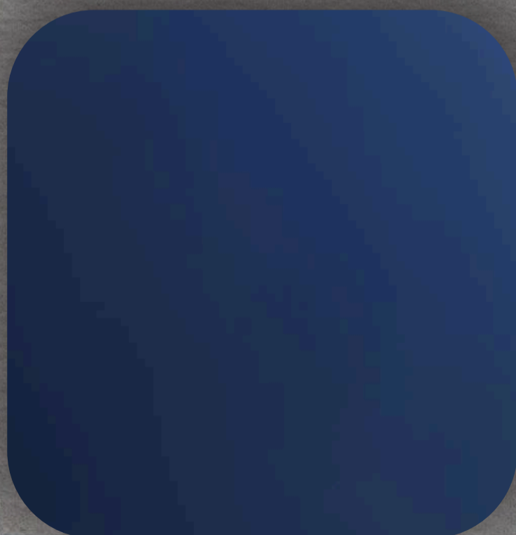
243 LIGHT BLUE