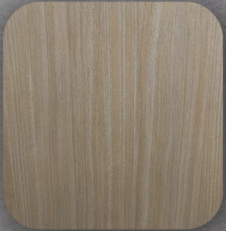
160 BIR OAK