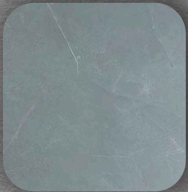
136 ATHENA MARBLE