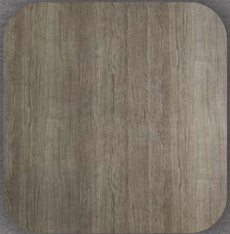
164 NATURAL OAK