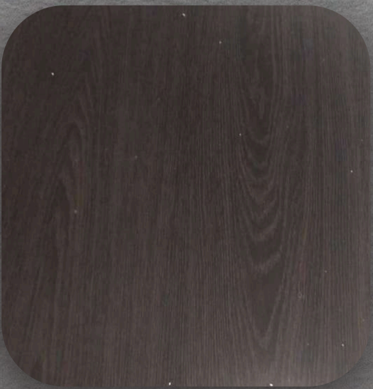
127 MANAS OAK