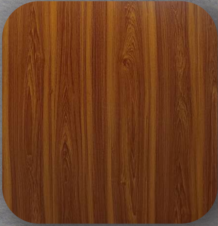
103 CEYLON TEAK