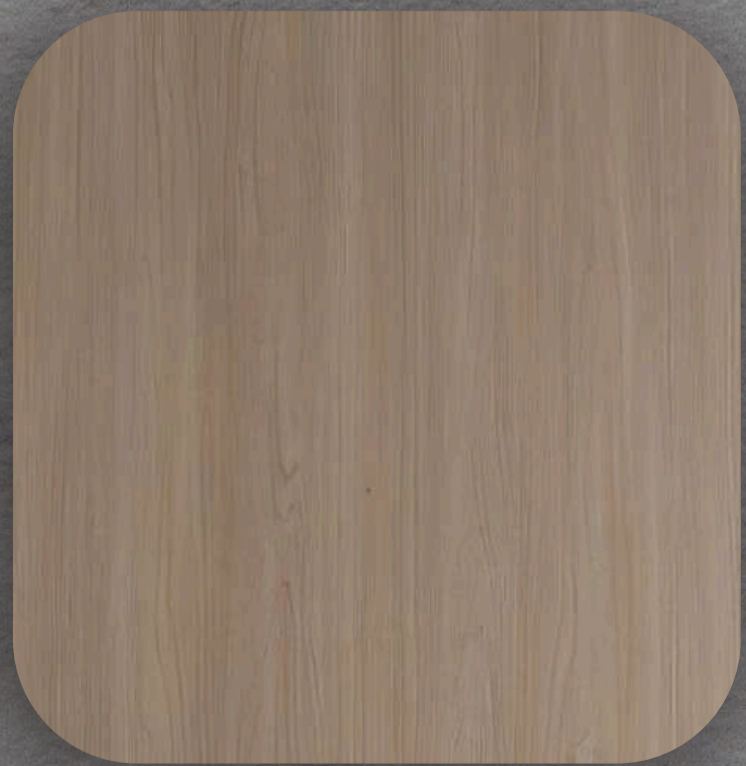
142 BUCHE BAVARIA