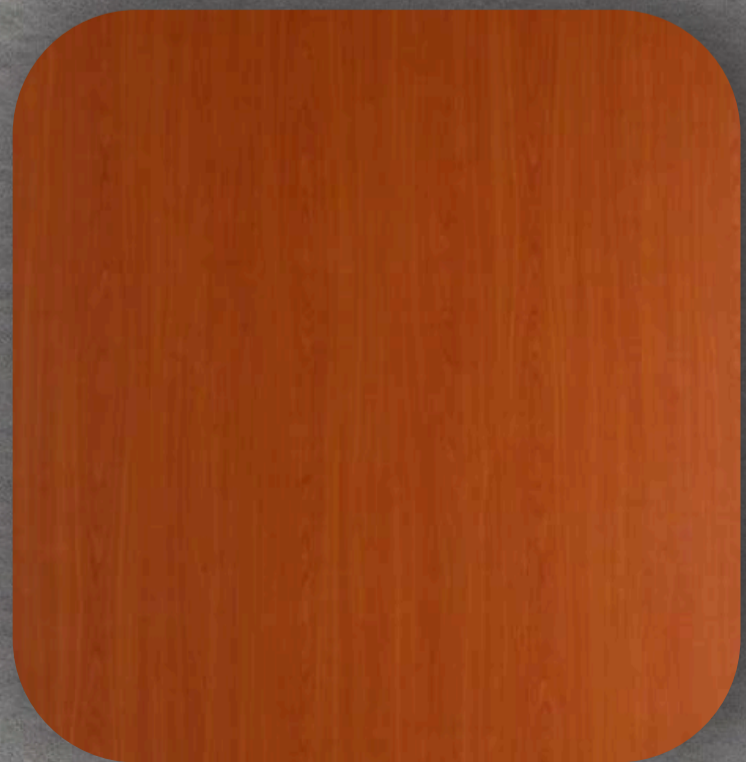
143 CILIGEO TENESSE