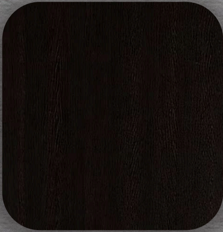
146 BLACK WANGE