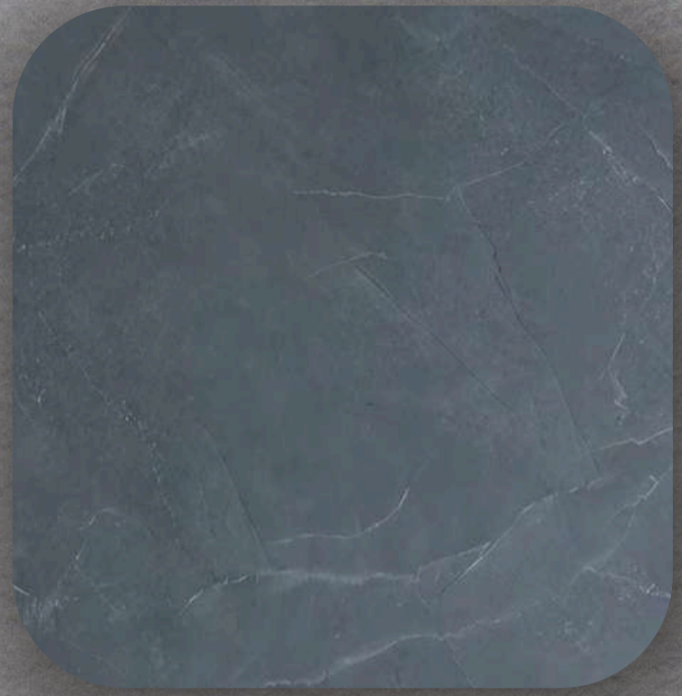
134 ATHENA MARBLE