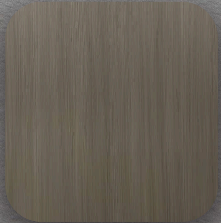
108 SOPHIA ELM