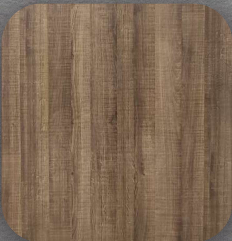
114 CLASSICAL OAK