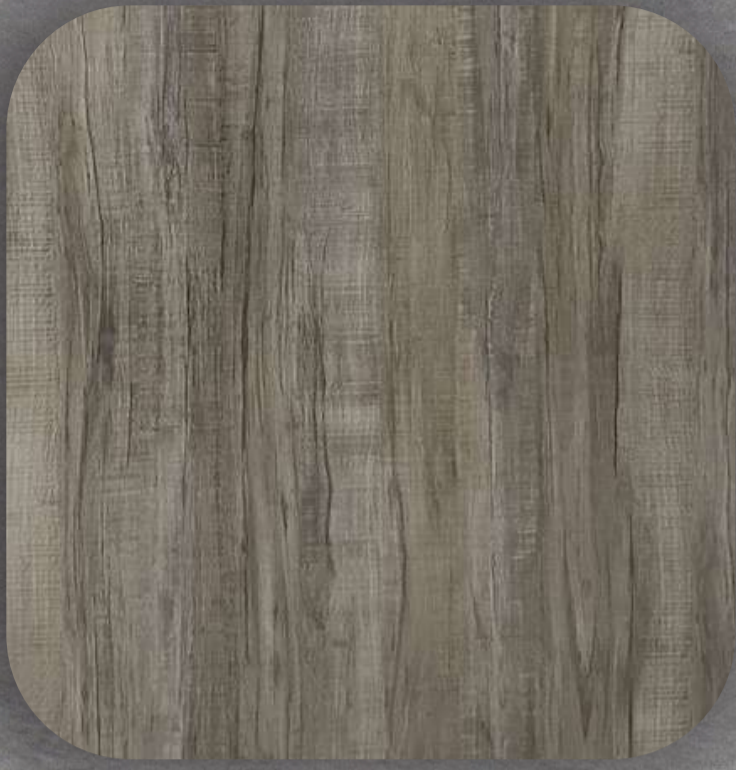
116 KNIFE CUTTING OAK