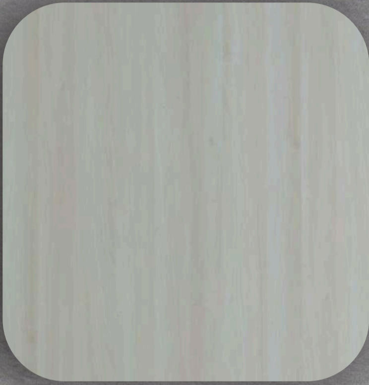
144 HIGHLAND PINE