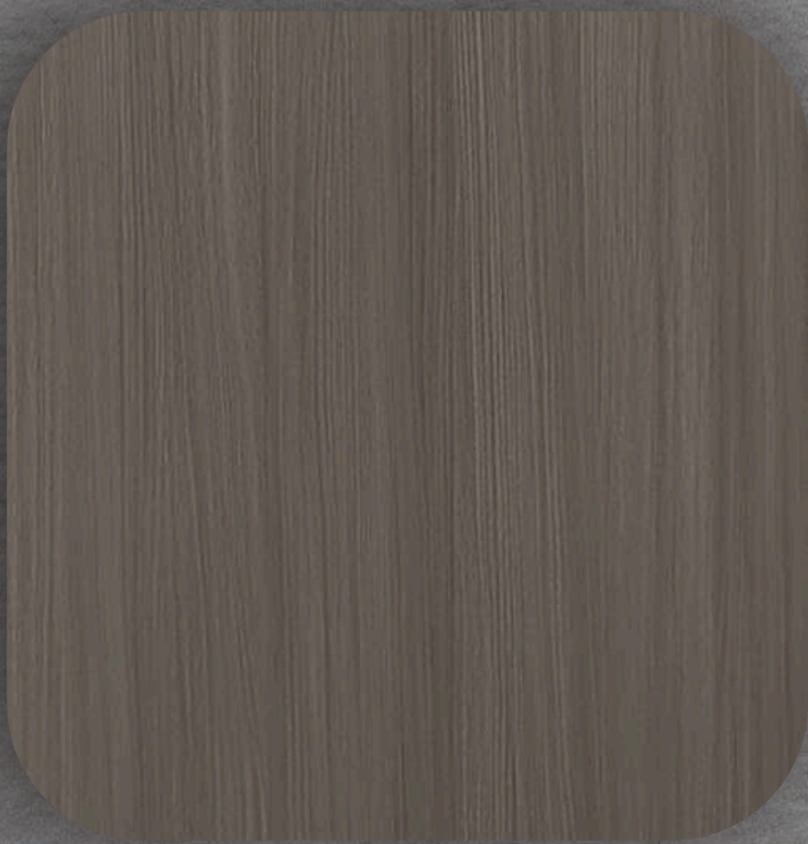
165 BUCOLI OAK