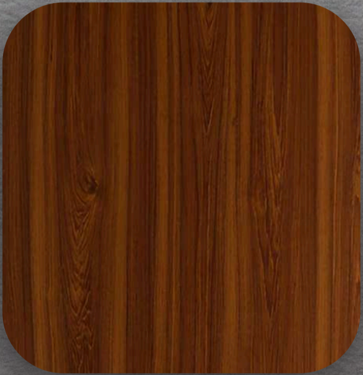
105 HIMALAYAN TEAK