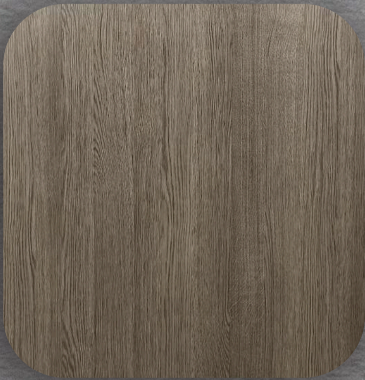
163 CHELELA OAK