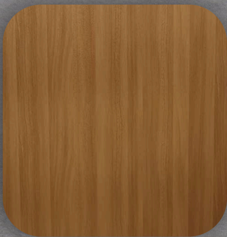
172 KHAYA MAHOGANY