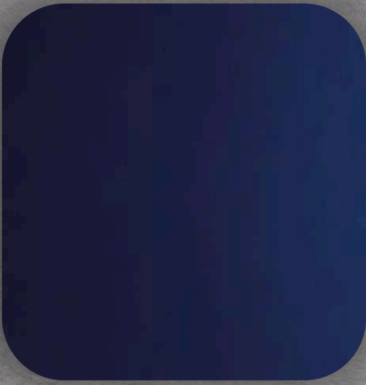
244 DARK BLUE