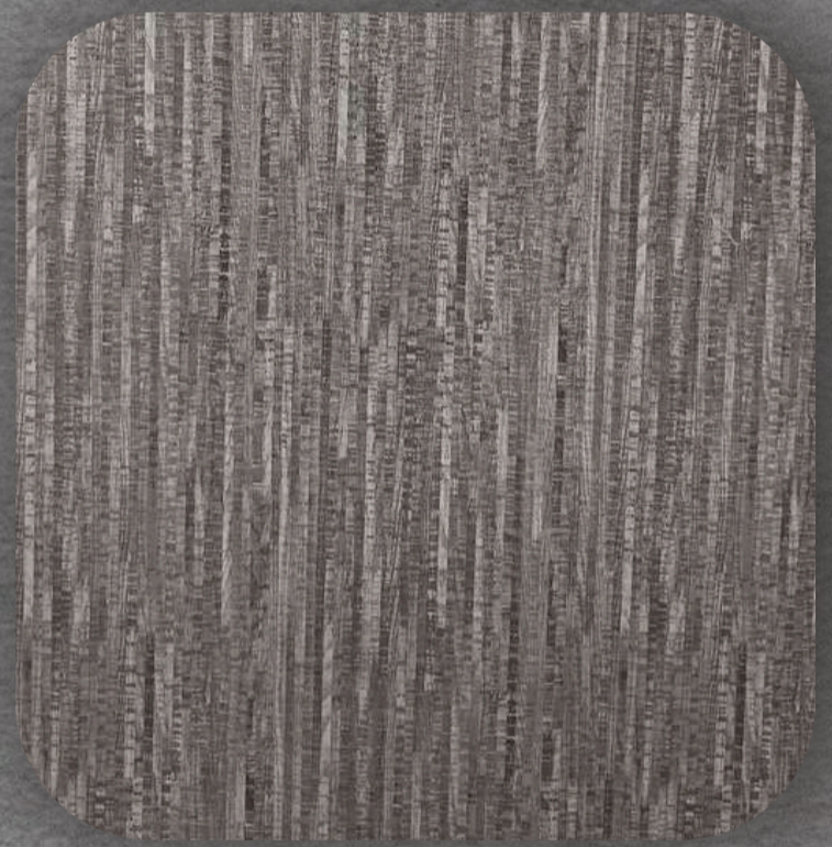
119 GRAY STONE