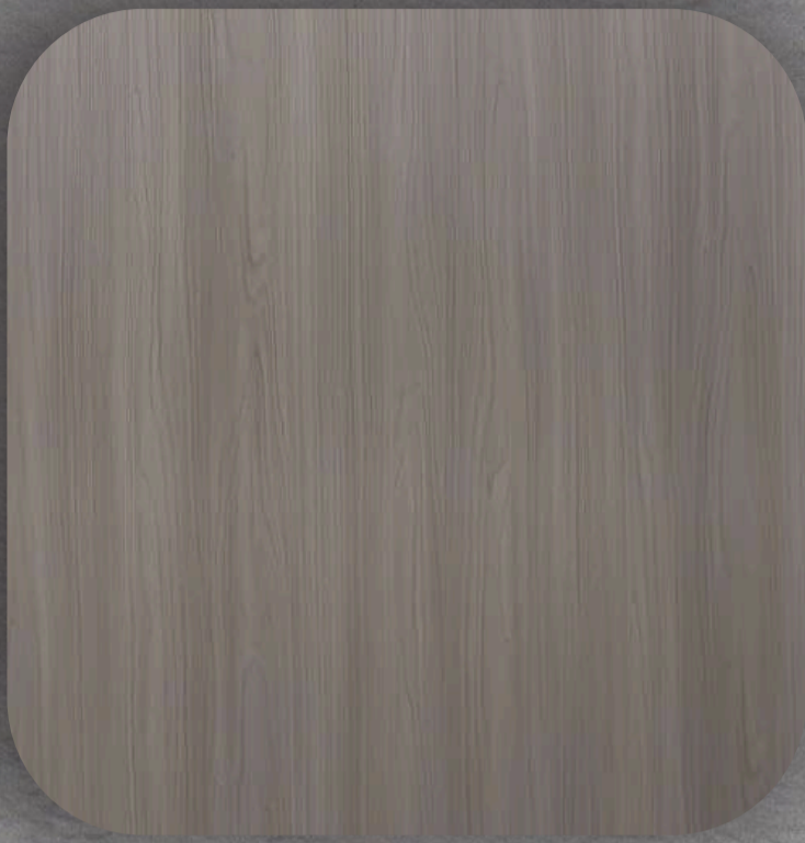
109 ROMAN WALNUT