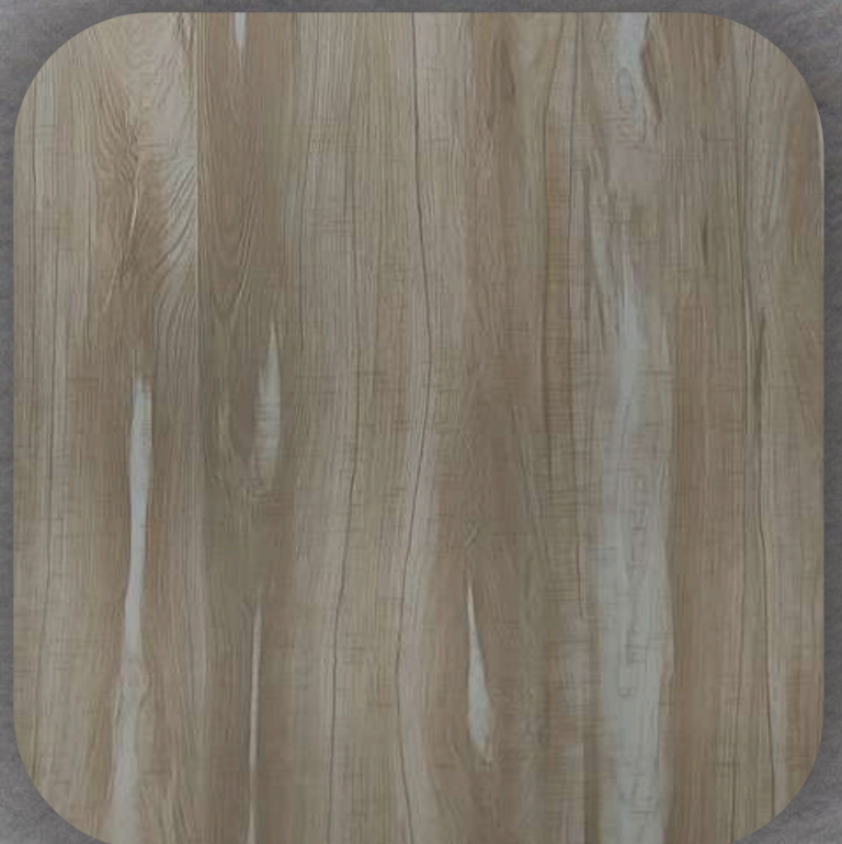
117 GOLD DUST OAK