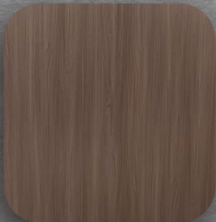
107 ROMAN WALNUT