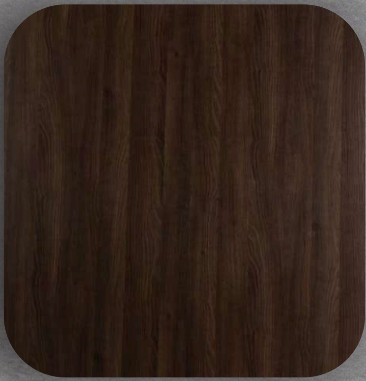
159 MOLDEA AKAZIA