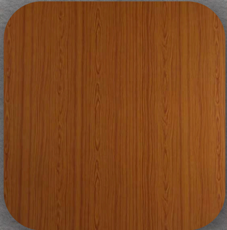
131 ODESSA BIRKE