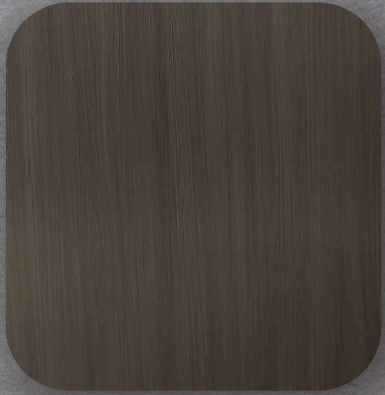
110 SOPHIA ELM