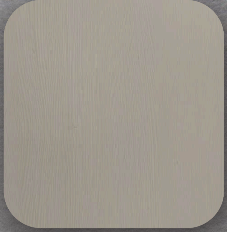
145 WHITE WANGE