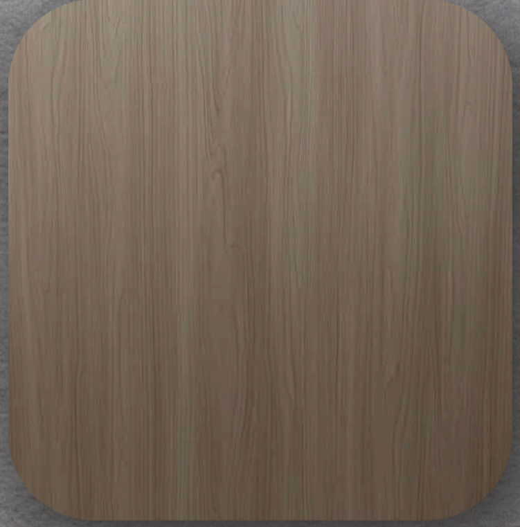
106 ROMAN WALNUT