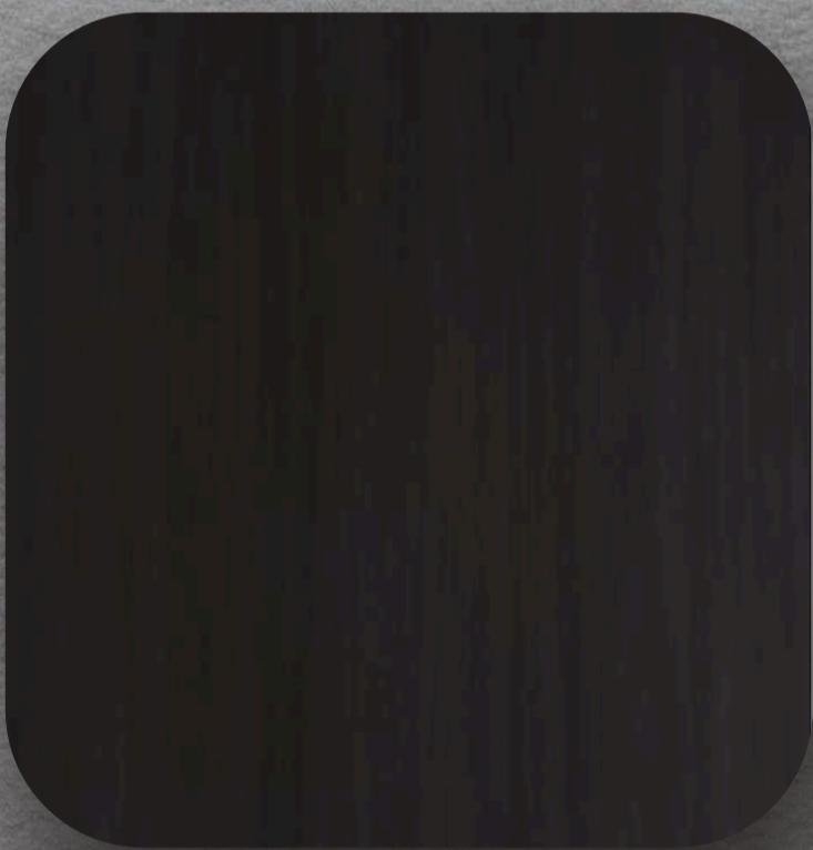
111 WEST VIRGINIA CHERRY