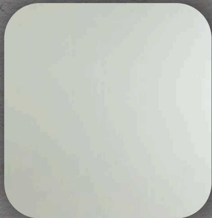
222 SILVER GREY