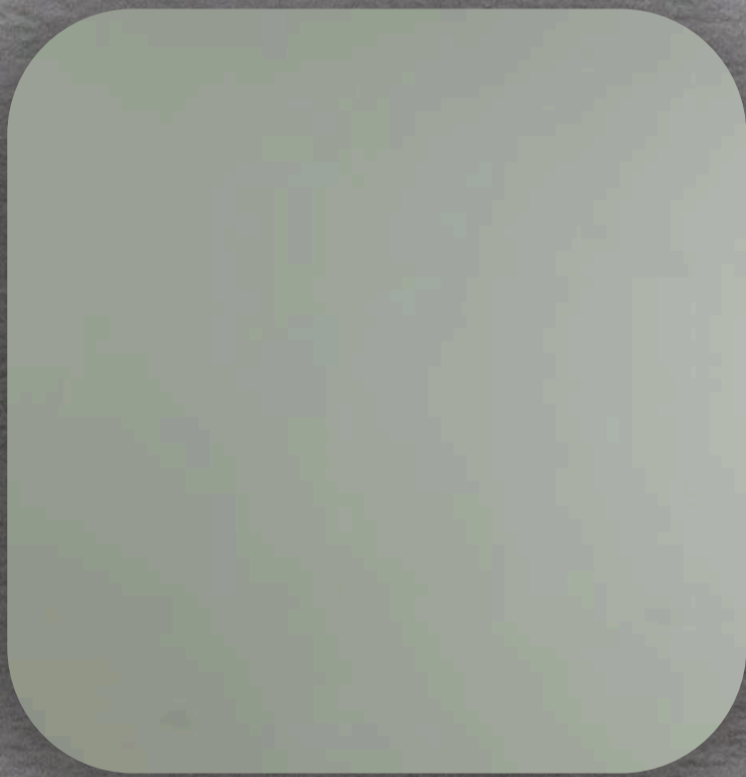
135 ATHENA MARBLE