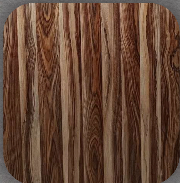
115 AFRICAN OAK