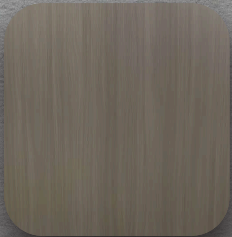
113 WEST VIRGINIA CHERRY