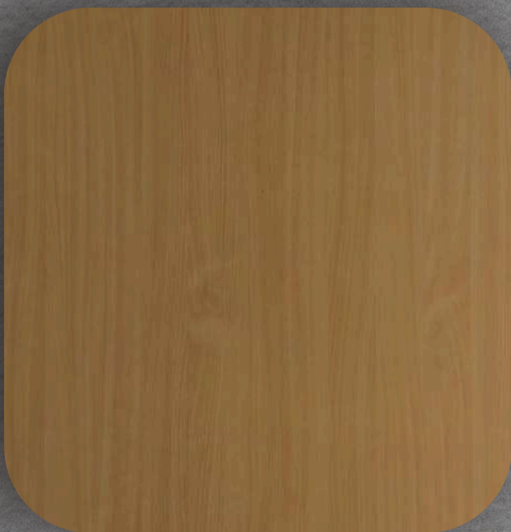
156 MANGFAL BUCHE