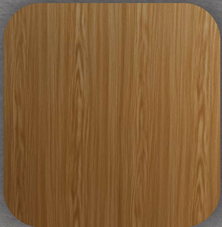
157 CALAIS EICHE